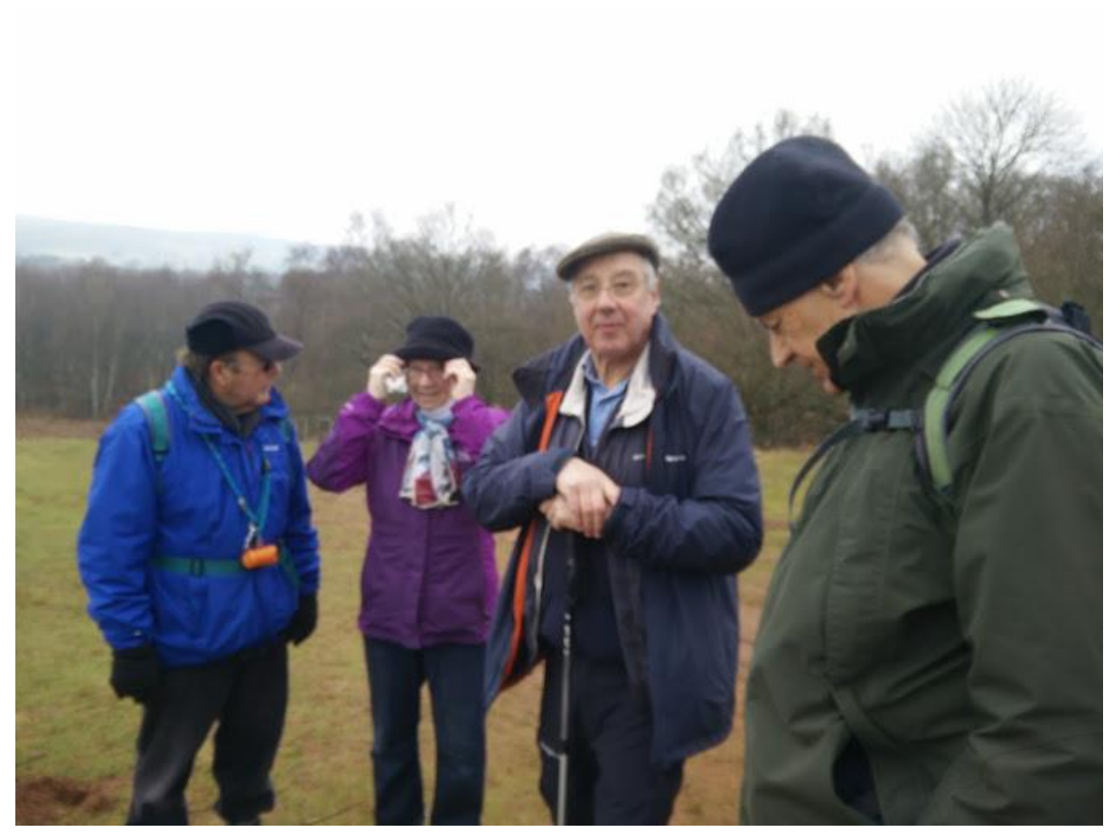
Our glorious leader